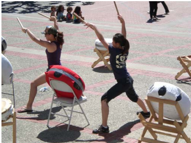
Cal Taiko members showing how it's done