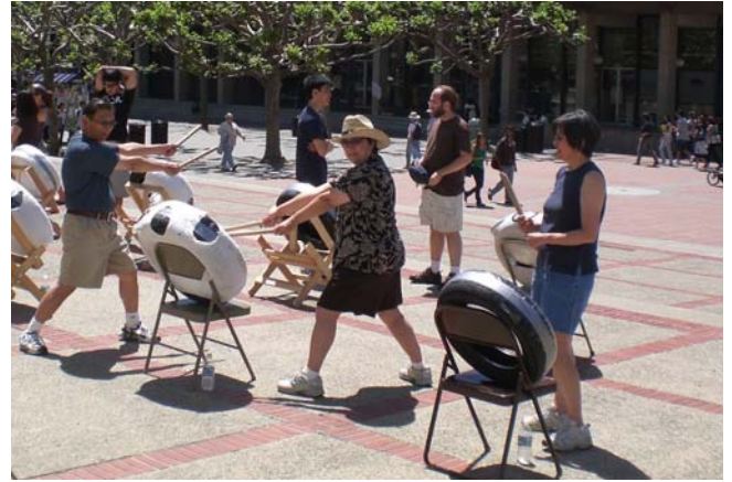
Berkeley JACLers Styling