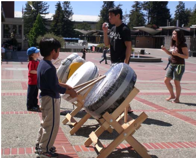
Young Taiko Drummers