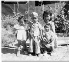
Topaz, Utah Japanese American Relocation Center